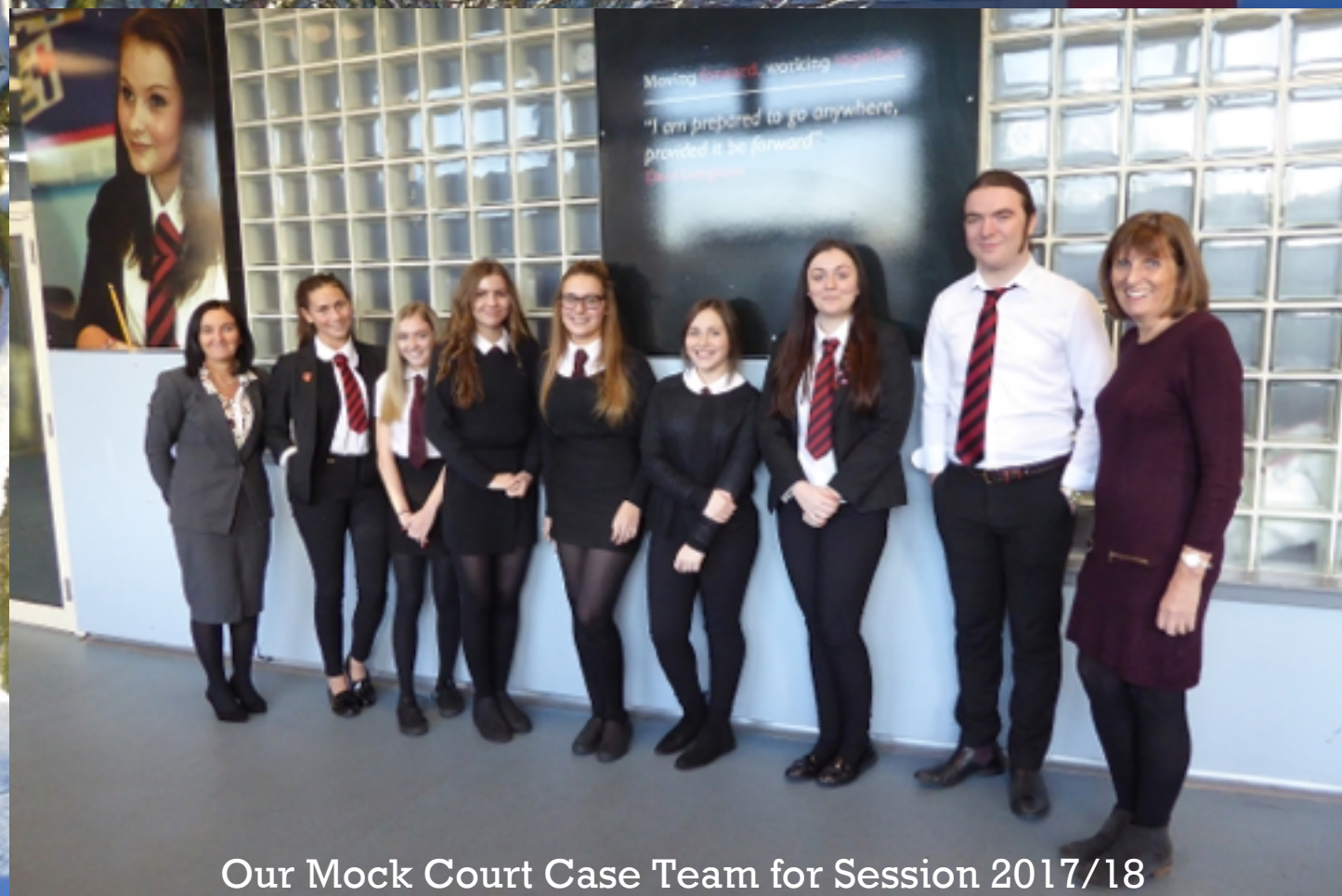
Our Mock Court Case Team for Session 2017/18