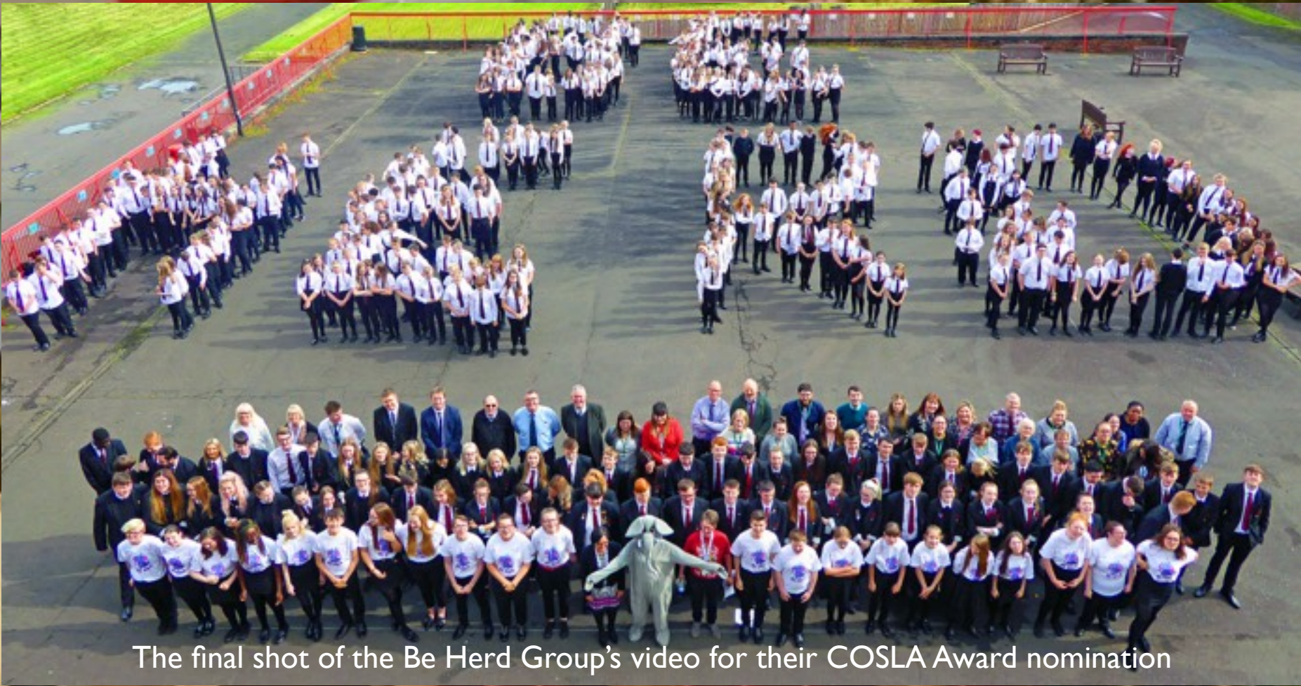
The final shot of the Be Herd Group's video for their COSLA Award nomination